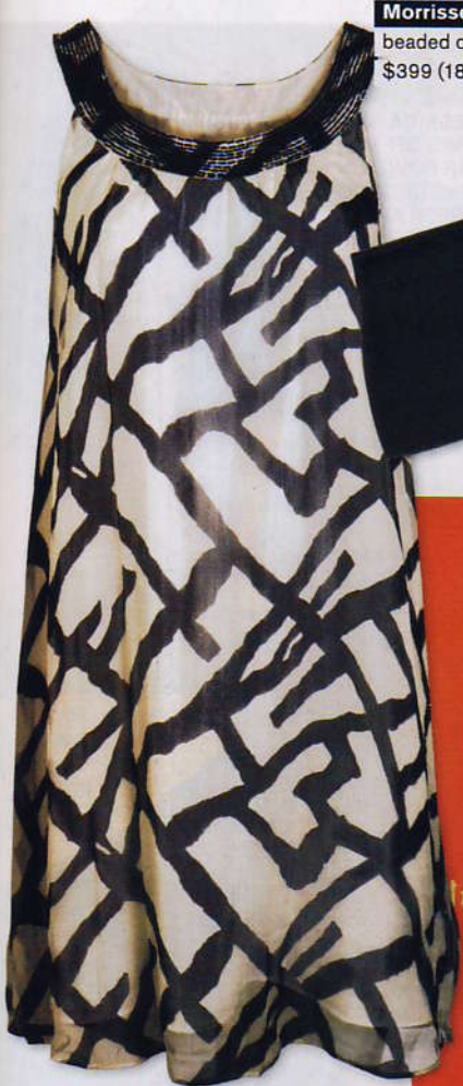
Morrissey beaded chiffon dress, $399 (1800 722 390)

WHEN YOU'RE BRONZED TO PERFECTION, YOU CAN LOOK AU NATUREL WITHOUT FEELING UNDERSTATED.