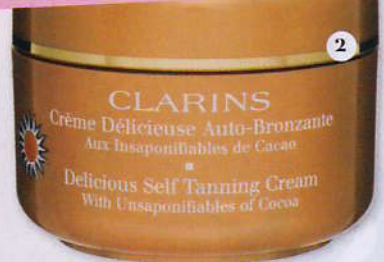
1. Jane Iredale PureGloss for Lips in Cotton Candy, $36 (1300 850 008) 2. Clarins Delicious Self Tanning Cream 125ml, $48 (02 9663 4277)