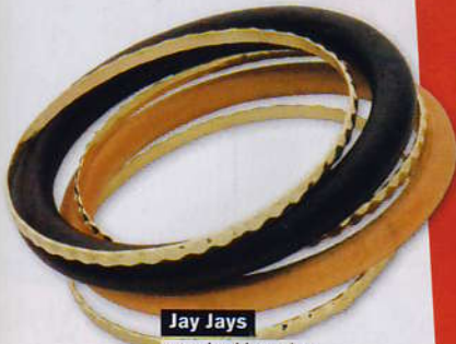
Jay Jays stacked bangles, $10 (1800 630 122)