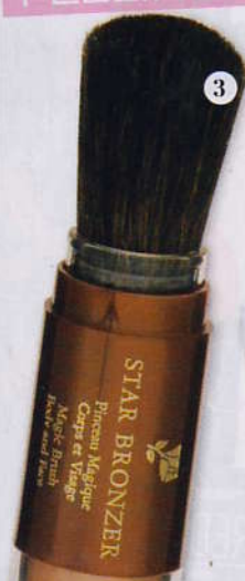
3. Lancome Star Bronzer Magic Bronzing Brush, $79 (02 9931 8888)