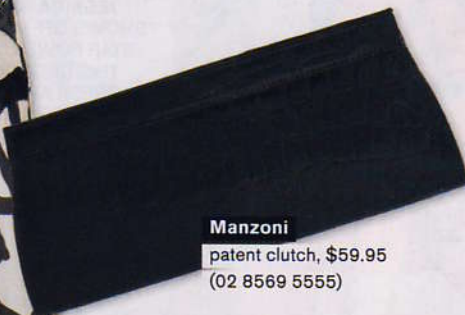
Manzoni patent clutch, $59.95 (02 8569 5555)