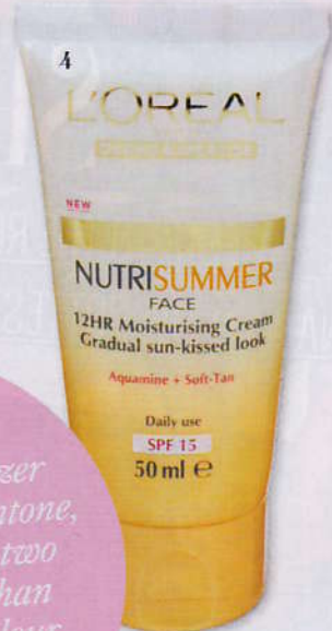
4. L'Oréal NutriSummer Face SPF+15 50ml, $15.65 (1300 659 259)

BEAUTY TIP To choose a bronzer that suits your skintone, go for a pigment two shades darker than your natural colour and always blend, blend, blend!