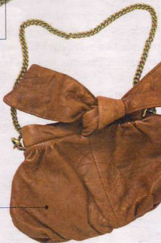
Manzoni leather bag, $89.