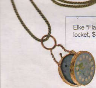
Elke "Flapper" locket, $160.