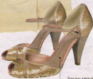
Jigsaw sequin shoes, $249.