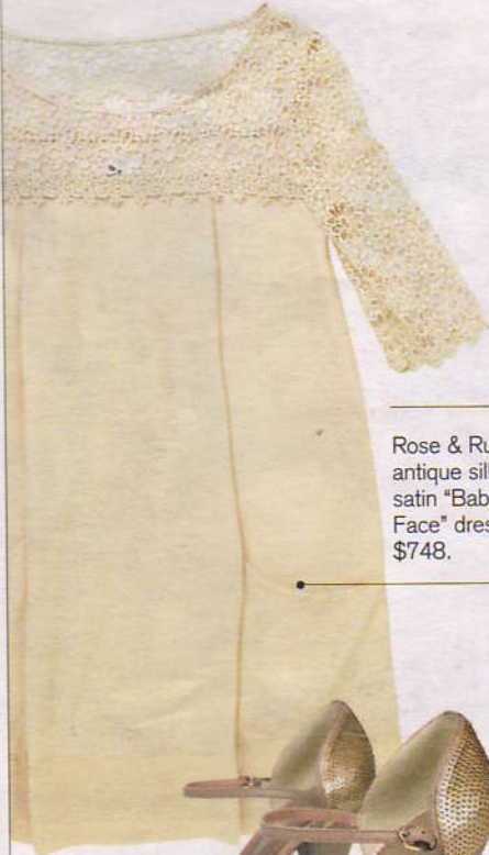
Rose & Ruby antique silk satin "Baby Face" dress, $748.