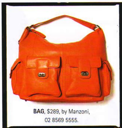
BAG , $289, by Manzoni, 02 8569 5555.