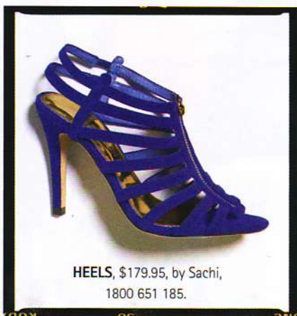
HEELS , $179.95, by Sachi, 1800 651 185.