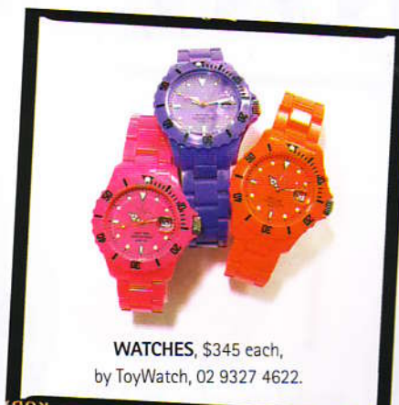
WATCHES , $345 each, by ToyWatch, 02 9327 4622.