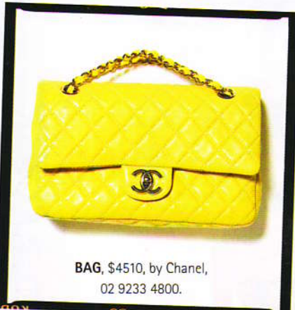
BAG , $4510, by Chanel, 02 9233 4800.