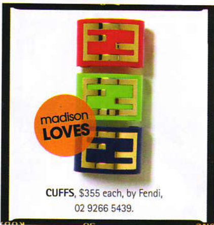
CUFFS , $355 each, by Fendi, 02 9266 5439.