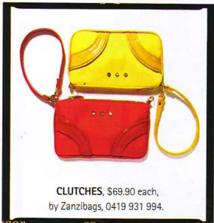
CLUTCHES , $69.90 each, by Zanzibags, 0419 931 994.

AN UPBEAT FORCE HAS SURGED INTO FASHION. GO FOR DYNAMIC NEON SHADES THAT PACK A POWERFUL PUNCH