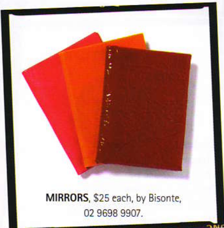
MIRRORS , $25 each, by Bisonte, 02 9698 9907.