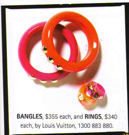
BANGLES , $355 each, and RINGS , $340 each, by Louis Vuitton, 1300 883 880.