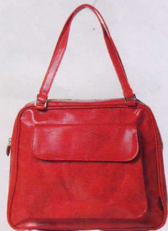
Red carry bag, $95, by Catherine Manuell Design.