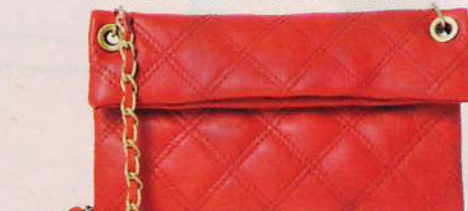
Red leather chain clutch, $59.95, from Manzoni.