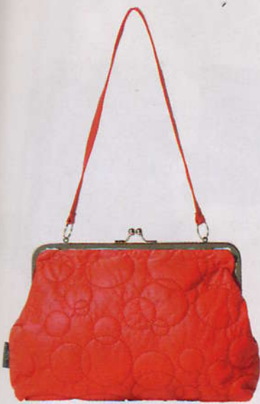
Red quilted leather bag, $80, by Catherine Manuell Design.