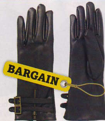
Black gloves, $19.99, from Equip.