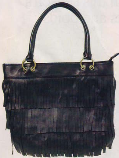
Black fringed bag, $64.95, by Indy C.