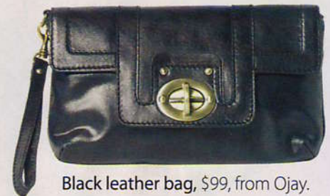
Black leather bag, $99, from Ojay.