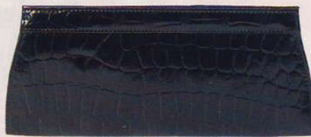
Black patent-leather mock-croc clutch, $59.95, from Manzoni.