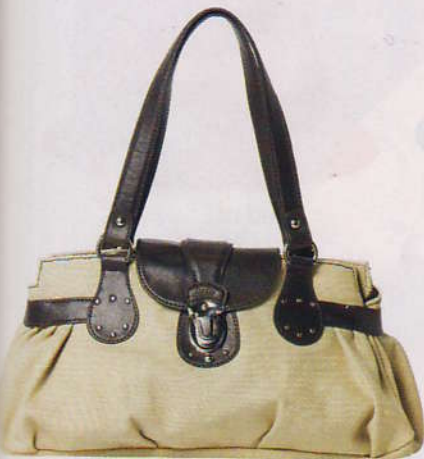
Canvas bag, $109.95, from MNG.