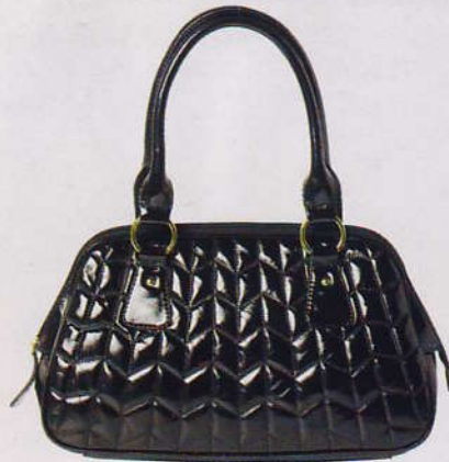
Black shiny quilted bag, $49.99, from Target.