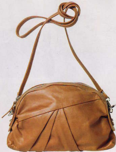
Brown Tini leather bag, $109.95, from Wittner.