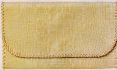
Cocktail leather clutch, $154, by Bahamonde.