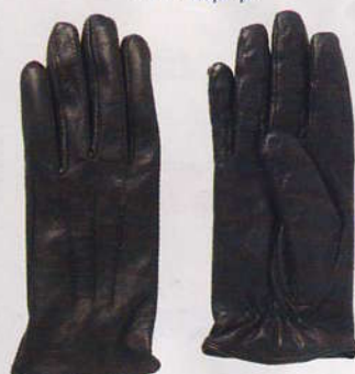
Black leather gloves, $49.95, from Manzoni.