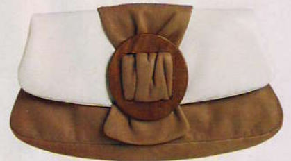
Woody bag, $109.95, from Wittner.