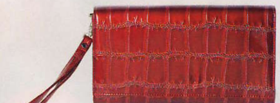
Red shiny mock-croc clutch, $65, by Catherine Manuell Design.