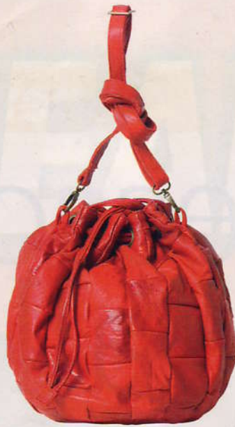
Red Caprice quilted leather handbag, $149, by Wish.