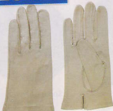
Beige leather gloves, $79.20, from Dents.