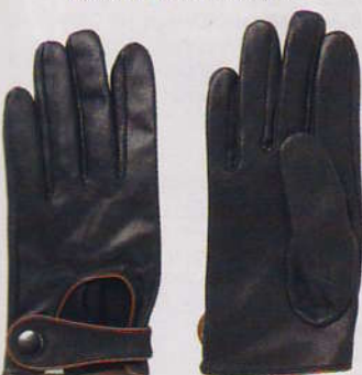
Black leather gloves with tan trim, $29.95, by Barkins.