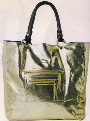
Gold Sienna oversized tote, $119, by Wish.