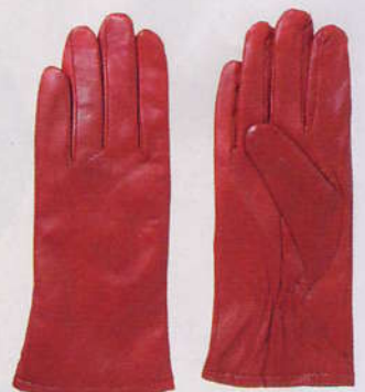
Red leather gloves, $49.95, from Manzoni.