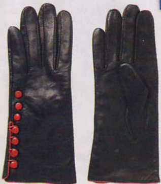
Black leather gloves, $89.95, by Morgan & Taylor.