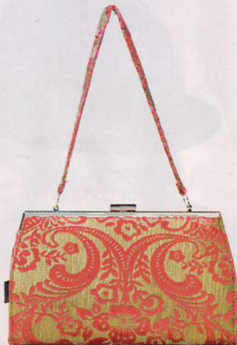
Helsinki canvas bag, $95, by Catherine Manuell Design.