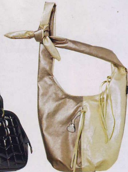
Matilda two-tone bag, $99, by Coquette Red.