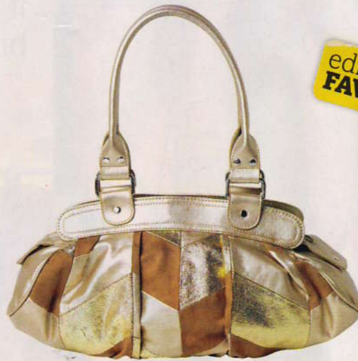
Gold patchwork bag, $44.95, from Missco Girl.