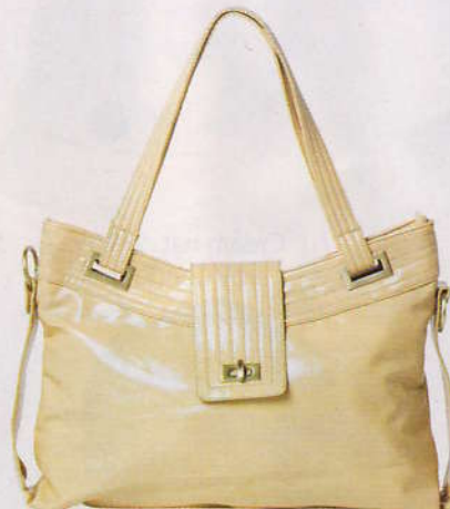
Nude bag, $79.95, by Indy C.