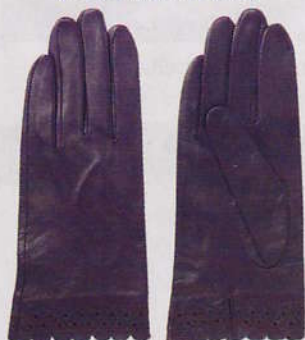
Purple leather gloves, $49.95, by Condura.