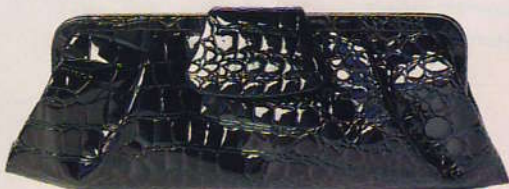
Black shiny mock-croc clutch, $29.95, by Lili.