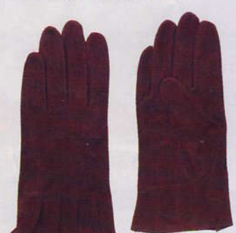
Berry suede gloves, $49.95, by Condura.