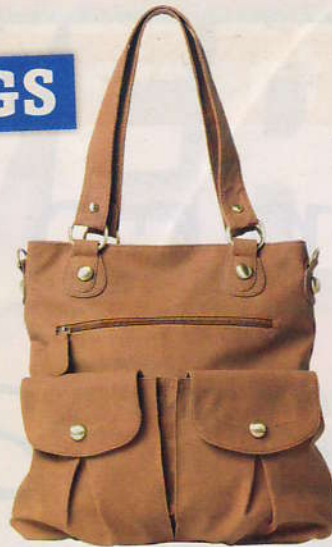
Tan button shopper, $49.99, from Forever New.