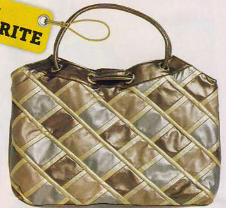
Gold patchwork bag, $59.99, from Target.