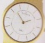
Skagen gold watch, $195.