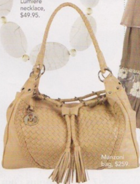
Manzoni bag, $259.