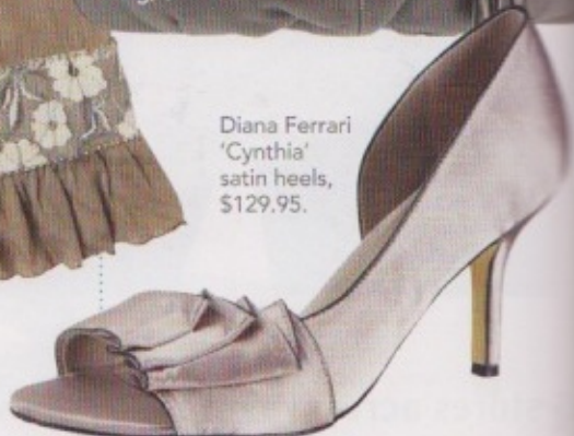
Diana Ferrari 'Cynthia' satin heels, $129.95.