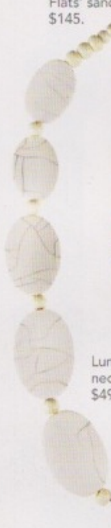
Lumière necklace, $49.95.