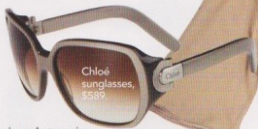
Chloé sunglasses, $589.

Chances are you already have a maxi dress or two in your wardrobe, but only revisit ones that reach your feet – three-quarter length is not the same trend. If you are shy about areas such as your upper arms, a sheer throw-over jacket can give you confidence, and shield you from draughts. Opt for open-toe shoes as closed-toe shoes can look frumpy with this look.