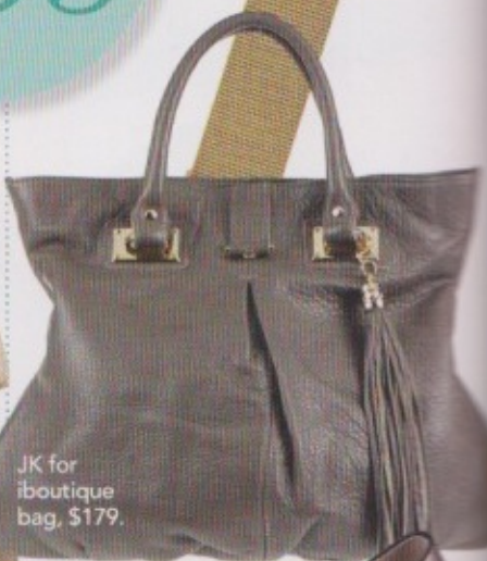
JK for iboutique bag, $179.