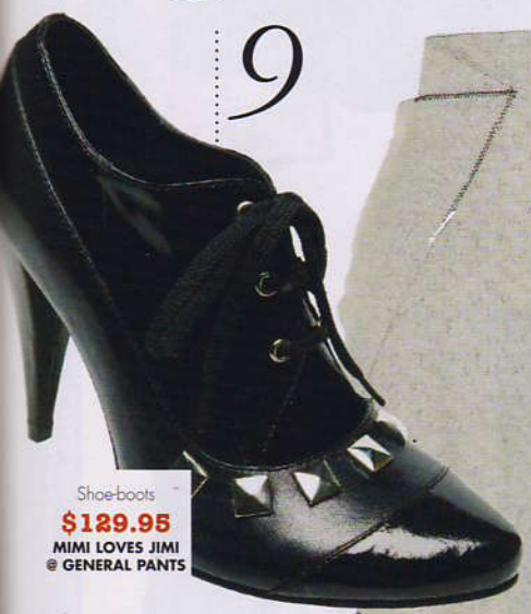
Shoe-boots $129.95 MIMI LOVES JIMI © GENERAL PANTS