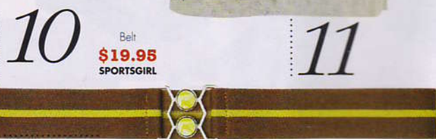
Belt $19.95 SPORTSGIRL