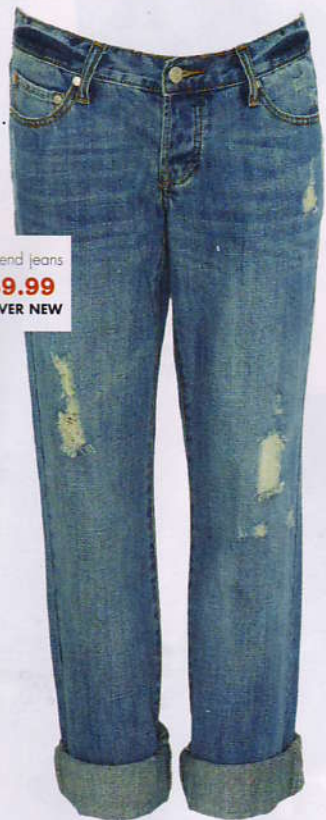
Boyfriend jeans $69.99 FOREVER NEW