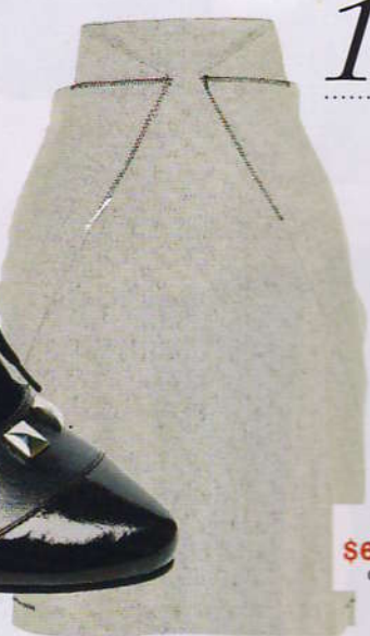
Skirt $69.95 GRAB