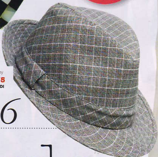
Trilby $35 JENDI

Tip Add a splash of colour to your look with a bright structured tote