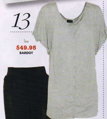
Tee $49.95 BARDOT