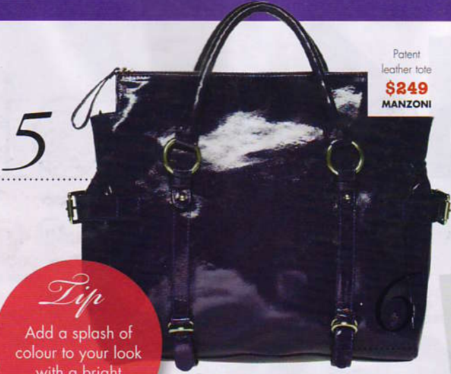
Patent leather tote $249 MANZONI

Tip Add a splash of colour to your look with a bright structured tote