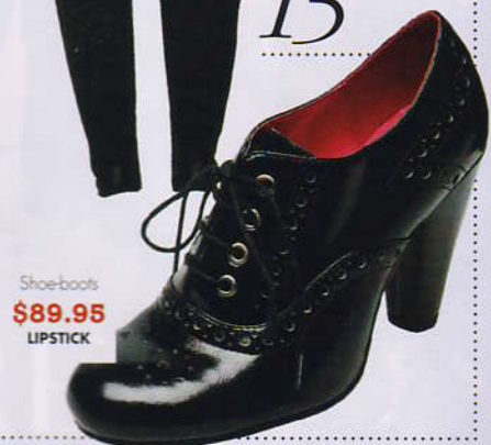
Shoe-boots $89.95 LIPSTICK

WHERE TO BUY: ANISE (02) 9212 3787 BARDOT (03) 9420 7900 BARKINS 1800 989 491 CUTLER AND GROSS 1800 008 139 FOREVER NEW (03) 9859 9111 GENERAL PANTS (02) 9290 0800 GRAB (03) 9411 0000 JENDI (02) 9565 1322 LIPSTICK (03) 9480 2455 MANZONI (02) 8569 5555 MIMI & ME WWW.MIMIANDME.COM.AU ONE TEASPOON (02) 9310 7522 SKINNY NELSON & FRIENDS (02) 9690 3555 SPORTSGIRL 1300 250 100 TEXT AND STYLING BY ROSIE MCKAY