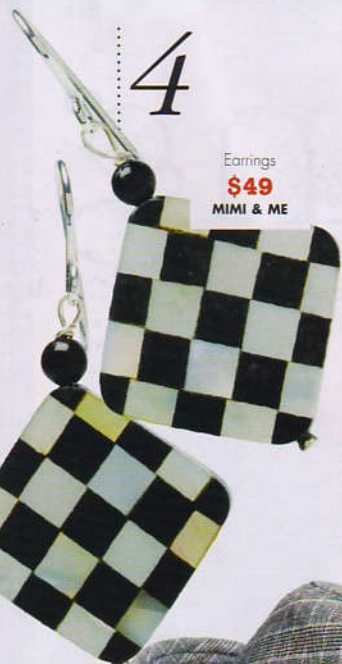
Earrings $49 MIMI & ME