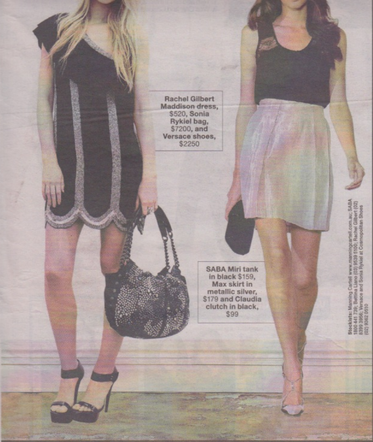
Rachel Gilbert Maddison dress, $520, Sonia Rykiel bag, $7200, and Versace shoes, $2250