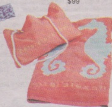
Peter Alexander towel with bag, $69.90

Stockists: Zimmermann 1800 738 895; Peter Alexander www.peteralexander.com.au ; Nine West 1800 099 378; Le Specs at Sunshades Eyewear 1300 721 160; Banana Boat 1800 810 310; Sportcraft 1800 002 477; Manzoni www.manzoni.com.au