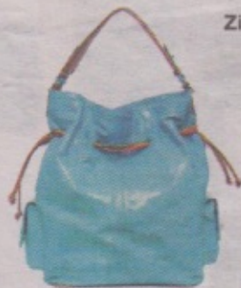
Manzoni bag, $329