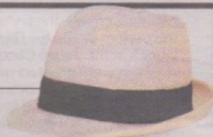
Nine West straw fedora, $99