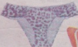
Zimmermann bikini, $195