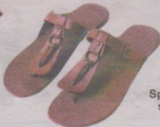
Sportcraft sandals, $99