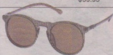
Le Specs sunglasses, $59.95

Stockists: Nine West 1800 099 378; Sybell Little Joe www.LittleJoeNY.com ; Peep Toe