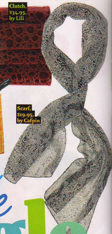
Scarf, $19.95, by Cafpin