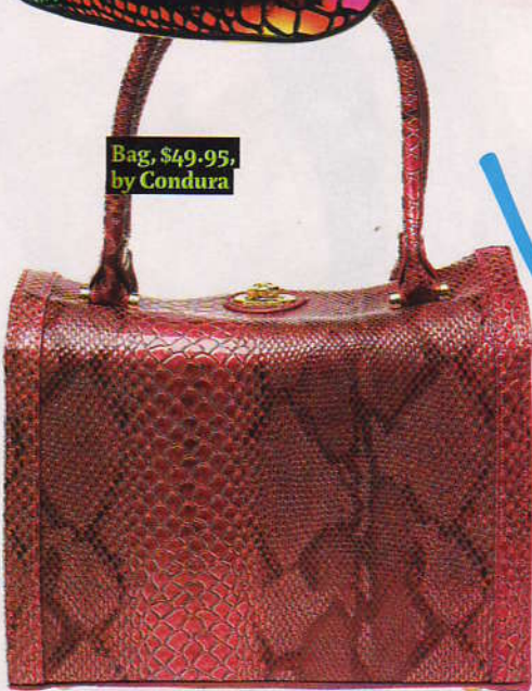
Bag, $49.95, by Condura