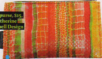
Coin purse, $15, by Catherine Manuell Design