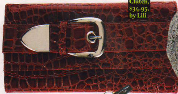
Clutch, $34.95, by Lili