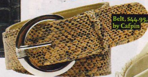
Belt, $44.95, by Cafpin