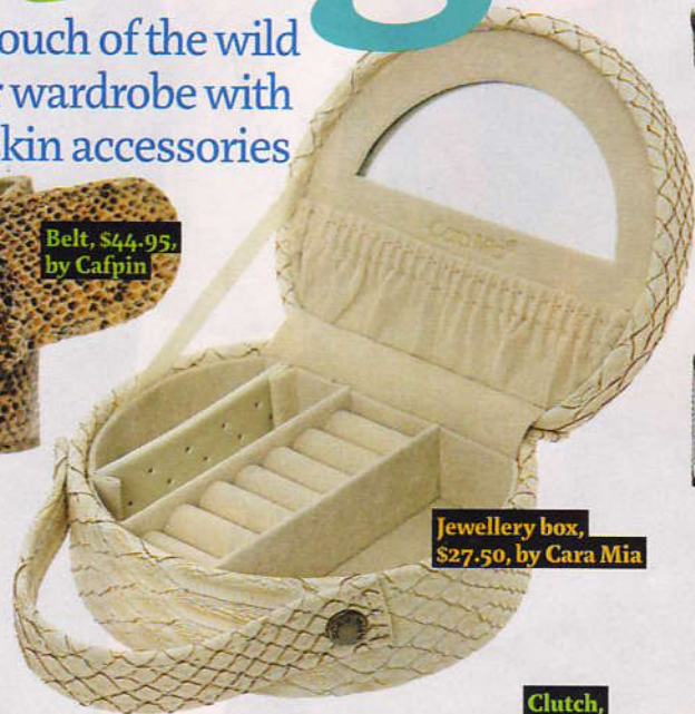
Jewellery box, $27.50, by Cara Mia