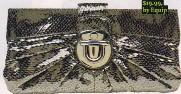
Clutch, $19.99, by Equip