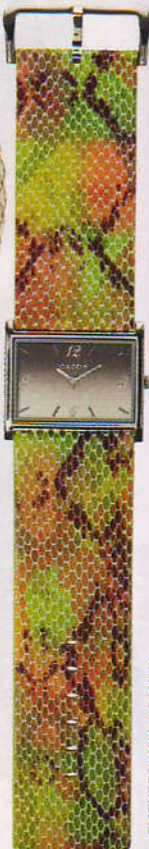
Watch, $139, by Caddy Design

STOCKISTS: CADDY DESIGN WWW.CADDYDESIGN.COM; CAFFPIN (02) 9211 7100; CARA MIA (02) 9698 8277; CATHERINE MANUELL DESIGN (03) 9499 9844; CONDURA (02) 8595 6999; EQUIP (02) 9479 7888; LILI (02) 9697 0577; MANZONI (02) 8569 5555; PAYLESS SHOES (02) 9741 4199; ZU 1800 199 662.