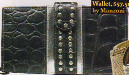
Wallet, $57.50, by Manzoni

Add a touch of the wild to your wardrobe with snakeskin accessories