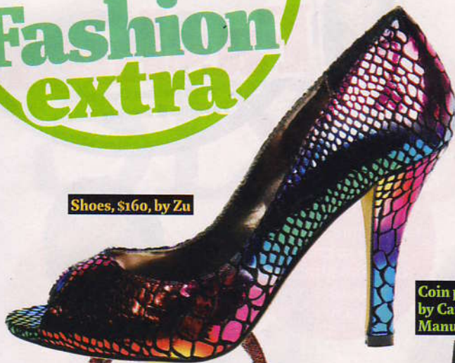
Shoes, $160, by Zu