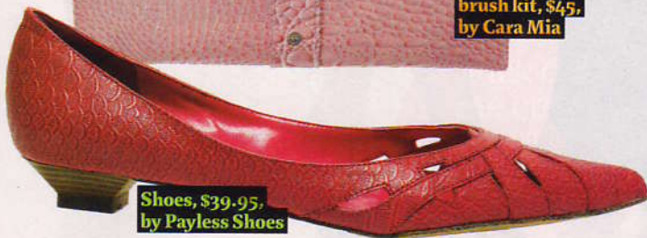
Shoes, $39.95, by Payless Shoes