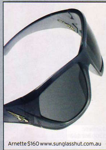
Arnette $160 www.sunglasshut.com.au