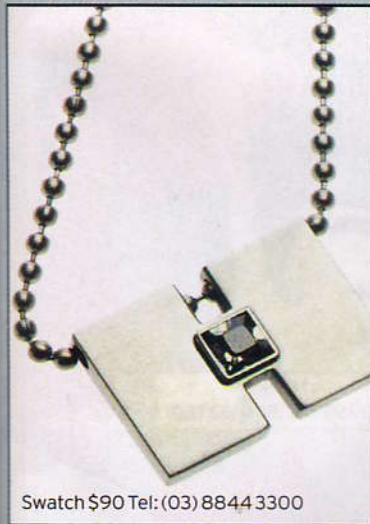
Swatch $90 Tel: (03) 8844 3300