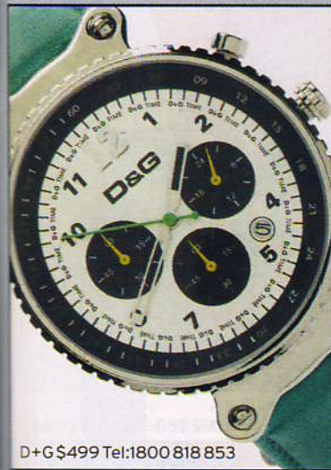
D+G $499 Tel: 1800 818 853