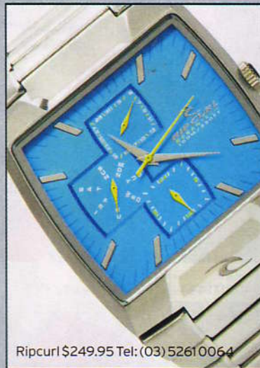
Ripcurl $249.95 Tel: (03) 5261 0064