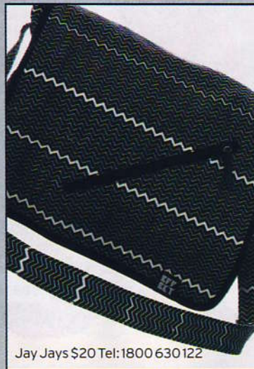
Jay Jays $20 Tel: 1800 630122