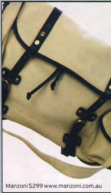
Manzoni $299 www.manzoni.com.au