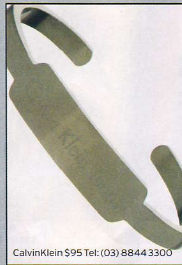
CalvinKlein $95 Tel: (03) 8844 3300