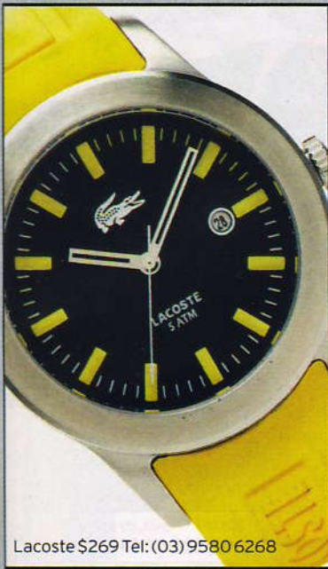
Lacoste $269 Tel: (03) 9580 6268